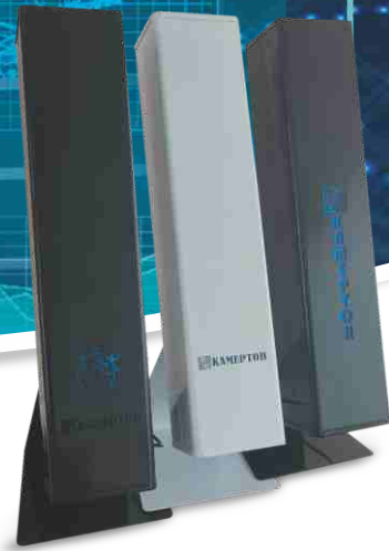
Purifier principle of operation